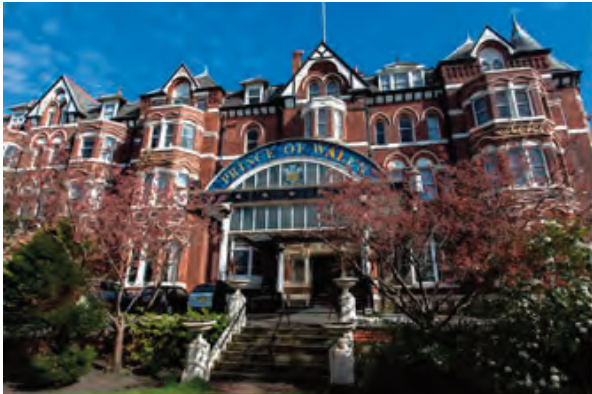
Prince of Wales Hotel Lord Street, Southport, PR8 1JS Tel : 0871 222 0039

If you are arriving later than 5.00pm please call & let us know so that we can make special arrangements to look after you as soon as you do arrive – Any difficulties on the day contact us on mobile 07868-424587.