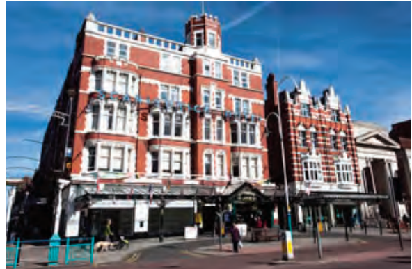
Scarisbrick Hotel 239 Lord Street, Southport, PR8 1NZ Tel : 0871 222 7006

You can check out all the facilities for Both Hotels, as well as the local attractions etc. on: