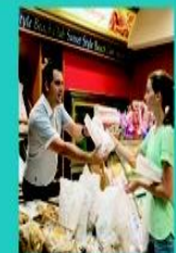
SUPERMARKET 1 st Fl. / 1 ª pl. Supermercado & Panadería