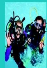
SCUBA • CLASES DE BUCEO Classes on request / Bajo cita

All services and facilities are subject to change. Todos los servicios e instalaciones están sujetos a cambio.