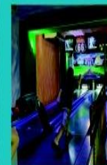
SALA OMEGA 5 th Fl. / 5 ª pl. Games room / Sala de Juegos

Free Wi-fi in public areas / Wi-fi gratis en zonas comunes